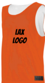
BOY'S PINNIE ORANGE/WHITE