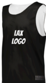
GIRL'S PINNIE BLACK/WHITE

pinnies: https://rpdiamond.com/products/ols/categories/loveland-youth-lacrosse